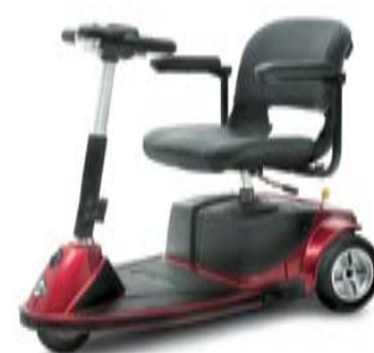
Revo® 3-wheel scooter